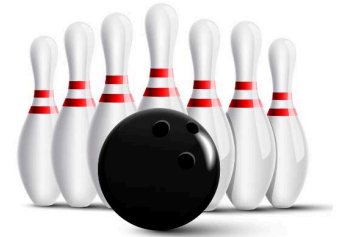
Cedar Lanes Sidney, NE